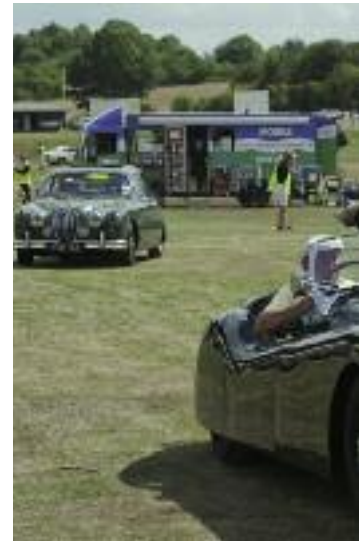
IN THE DRIVING SEAT: break from 'Ivanhoe' in h